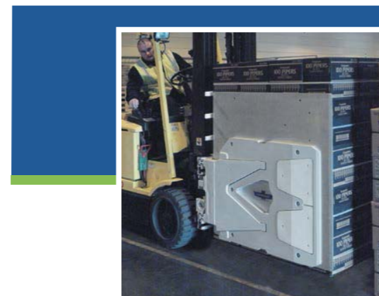
纸箱夹 Carton Clamps

推拉器通过用滑板取代托盘，来对货物进行装船、收货和入库等作业。采用滑板可省去托盘的购买、维护、报废以及存储费用，同时可提高空间利用率。Push/Pulls allow you to ship, receive and warehouse unit loads on inexpensive slip sheets rather than pallets. Using slip sheets eliminates the cost of pallet purchase, maintenance, disposal and storage while increasing cube utilization.