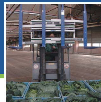
单双托盘叉 Multiple Load Handlers

食品行业的仓储中心和配送机构可以从分层拣货器的快捷性和多用途性中受益。在堆放混合型货物堆垛时，分层拣货器可搬运单层或多层的听装和瓶装产品，从而降低了人工搬运成本。Food warehouses and distribution facilities can benefit from the speed and versatility of the Layer Picker. When building mixed load pallets, the Cascade Layer Picker handles single or multiple layers of both canned and bottled product, eliminating costly manual labor.