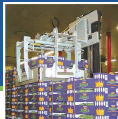
分层拣货器 Layer Pickers

食品行业的仓储中心和配送机构可以从分层拣货器的快捷性和多用途性中受益。在堆放混合型货物堆垛时，分层拣货器可搬运单层或多层的听装和瓶装产品，从而降低了人工搬运成本。Food warehouses and distribution facilities can benefit from the speed and versatility of the Layer Picker. When building mixed load pallets, the Cascade Layer Picker handles single or multiple layers of both canned and bottled product, eliminating costly manual labor.