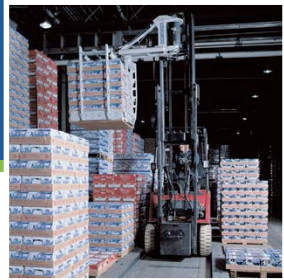
分层拣货器 Layer Pickers

配送机构可从分层拣货器带来的速度和多用途性中受益。在堆放混合型货物堆垛时，分层拣货器可搬运单层或多层的听装和瓶装产品。卡斯卡特多用途分层拣货器为您节省人力成本。