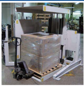
固定式货物翻转器 Stationary Load Inverter

这是一种可靠、经济、高效的翻转货物的方式。可用于转换货物的托盘或滑板，冷冻隔板移除，破损托盘更换或破损纸箱替换等。同时还可堆垛更换破损的底层货物。