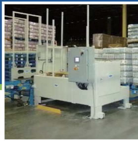
货物转换站 Load Transfer Stations

叉车司机无需离开作为便可快速、高效地进行货叉调距，从而实现快速搬运货物并降低产品破损。卡斯卡特调距叉提高了生产率并帮您降低了产品破损。Fast and accurate fork positioning without leaving the driver's seat allows faster load handling with reduced product damage. A Cascade fork positioner increases productivity and helps reduce damage.