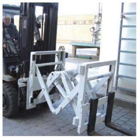
伸缩叉架 Load Extenders

Distribution facilities can benefit from the speed and versatility the Layer Picker offers. When building mixed-load pallets, the Cascade Layer Picker handles single layers or multiple layers of both canned & bottled product. Replace costly manual labor with the versatile Cascade Layer Picker.