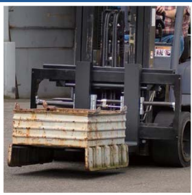
调距叉 Fork Positioners

A reliable, economical and efficient means of inverting loads. Allows transfer of product to pallet or slipsheet, freezer spacer removal, damaged pallet exchange or damaged carton replacement. Also provides system for damaged product recovery from bottom of stack.