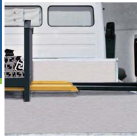
前移叉 Telescopic Forks

伸缩叉架让你具备推出货物的灵活性，这使得在货车单侧进行装卸货变成了可能。它可以结合货叉、调距叉或其它夹类产品一起使用以适应您的特殊工况。The Load Extender allows you the flexibility to push the load making it possible to load/unload from one side of a truck. It can be used in combination with forks, fork positioners or other clamps in order to accommodate your specific application.