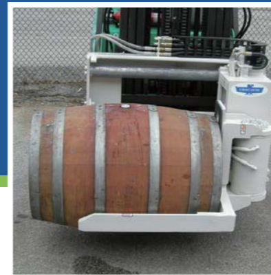
酒桶搬运器 Wine Barrel Handlers

一种专为“酒窖”或“窄巷道”场合作业而设计的经济型解决方案，卡斯卡特酒桶搬运器可对酒桶进行抓取、堆垛、下降和旋转等作业，将人工搬运最小化，将生产率最大化。