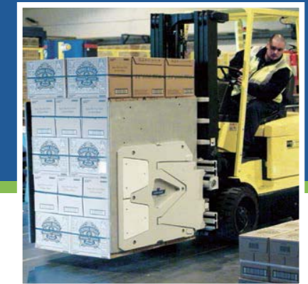
纸箱夹 Carton Clamps

Allows a driver to use the same lift truck to handle either single or double pallet loads. Spreading the four forks allows handling of two pallets side by side. When brought together, the four forks convert to two forks ready for single pallet handling. Well suited for truck trailer loading and unloading.