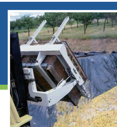
前倾卸货器 Forward Bin Dumpers

Rotators give your driver the ability to quickly dump or invert a load and immediately return the forks to the pick up position in one continuous motion. For use where bins or tote boxes are used for both dumping and general handling requirements.