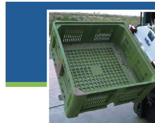
旋转器（带箱体固定装置） Rotators with Bin Hold Down

纸箱夹可实现无托盘搬运，节省了托盘的购买，维护，运输以及存储等相关费用。同时也提高了采用无托盘搬运方式时的仓储空间利用率。Carton Clamps allow palletless handling, and save money on pallet purchasing, maintenance, shipping and storage. Improves warehouse space utilisation with palletless handling.