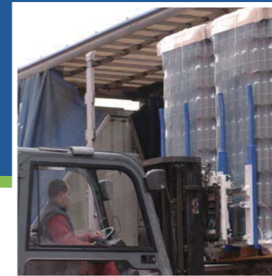
单双托盘叉 Single-Double Pallet Handlers

An economical solution for working in the cave or in narrow aisles...the Cascade Wine Barrel Handler grabs, stacks, lowers and spins barrels, minimizing manual handling while maximizing productivity.