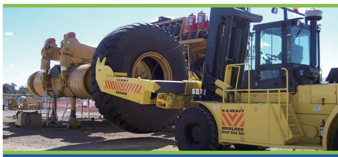
安全、全方位的轮胎搬运解决方案。 Safely Handle Tires and Rims with Cascade's Tire Handling Solutions.